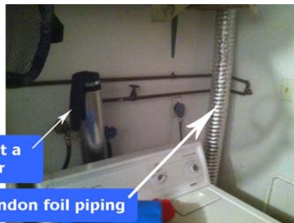
Stocking not a good filter